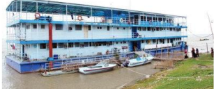
ভাসমান হাসপাতাল 'বীরনতী'। এটি সরকারি মালিকানাধীন। সম্প্রতি মালিকগঞ্জ জেলা পরিষদের উদ্যোগে নির্মাণ করা হয়েছে।

প্রতিনিধি, মালিকগঞ্জ ১৪ জুলাই ২০১৯, ০৯:২৪ আংরিভে: ১৪ জুলাই ২০১৯, ০৯:২৬