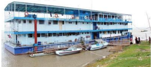
ভাসমান হাসপাতাল 'বীরনতী'। এটি সরকারি মালিকগঞ্জের একটি স্বাস্থ্যকেন্দ্রে স্থাপিত।

প্রতিনিধি, মালিকগঞ্জ ১৪ জুলাই ২০১৯, ০৯:২৪ আংরিভে: ১৪ জুলাই ২০১৯, ০৯:২৬