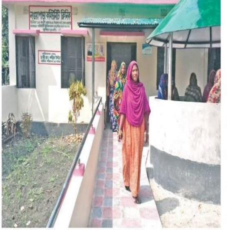
Nogara Community Clinic in Meherpur is among the 45 clinics that have been renovated and put under management of locals under a project

In Meherpur's remote Gangni upazila, the community clinic has been changing people's lives